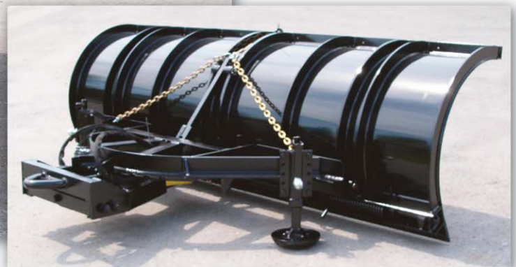
▲ Henke 41R11 PCL Plow - Shown with Optional Trip Edge, Mushroom Shoes and Loop Hitch