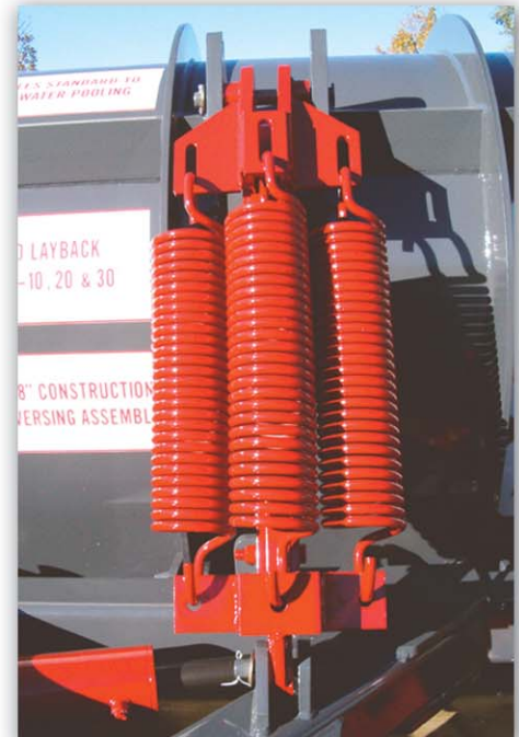
▲ Henke Extension Spring Safety Trip