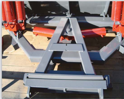
▲ Henke Tube Table and A Frame Assembly